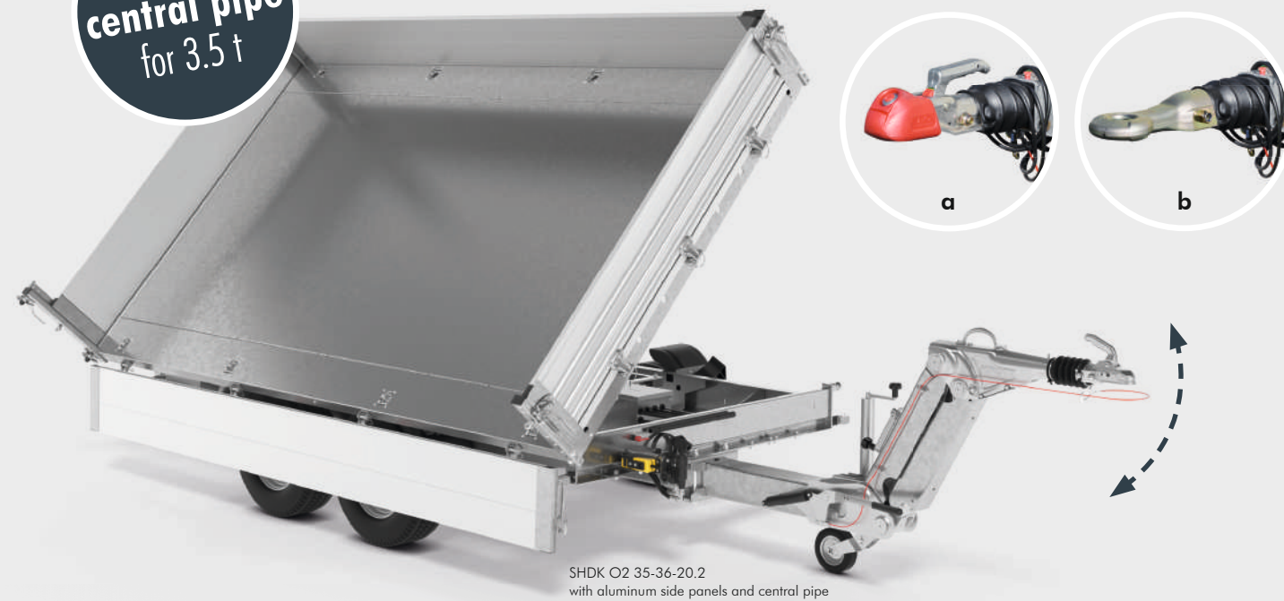
SHDK O2 35-36-20.2 with aluminum side panels and central pipe