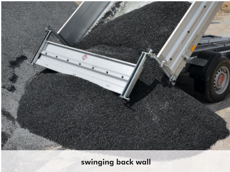
swinging back wall