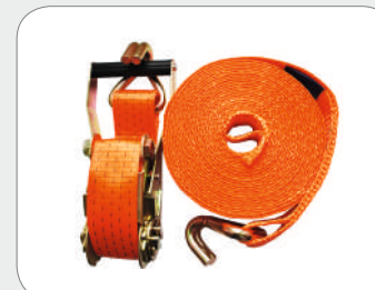
fastening belt kit