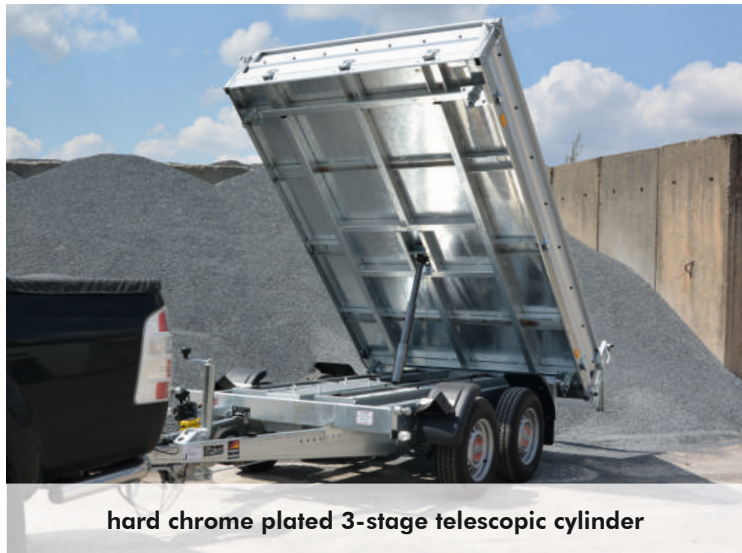
hard chrome plated 3-stage telescopic cylinder

The aluminium ramps can be slid over the entire loading width. They fit in every track gauge. A rail bracket can be optionally integrated in the chassis and contains a lockable compartment. A safe and smooth transport can be always guaranteed.