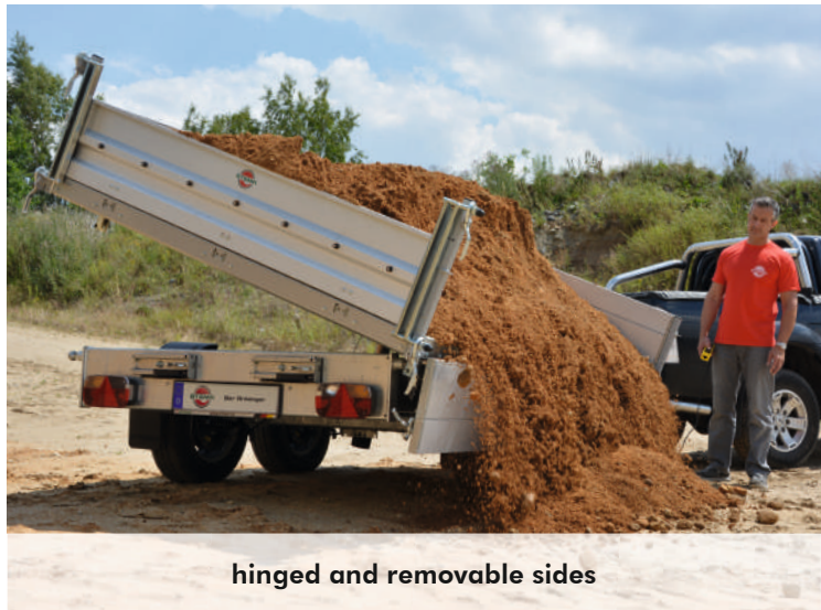
hinged and removable sides