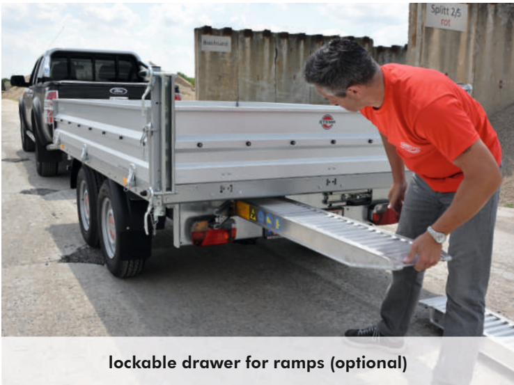
lockable drawer for ramps (optional)