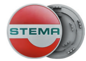
wheel caps (2 pcs.)