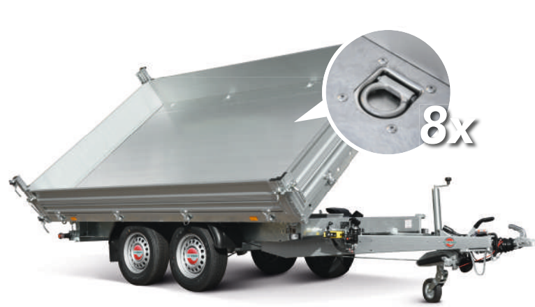
galvanized steel base with eight retractable heavy duty lashing rings